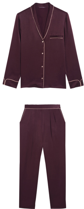
Pyjama top - €85 / Pyjama trousers - €65